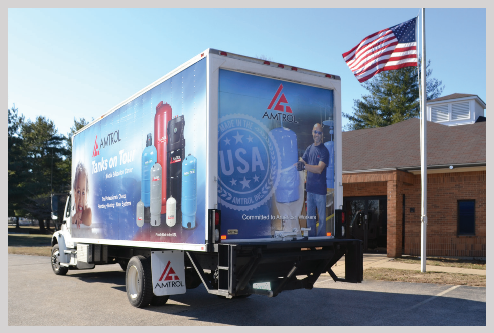
Tanks on Tour™ in front of the Amtrol Education Center.

All models are Amtrol Rewards<sup>™</sup> eligible. Visit amtrolrewards.com